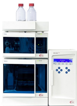
Fig. 1. ALEXYS Neurotransmitter Analyzer

The ALEXYS Neurotransmitter Analyzer (Fig. 1) consists of a P6.1L pump with integrated degasser, DECADE Elite electrochemical detector, AS6.1L autosampler and Clarity data acquisition software. The LC-ECD conditions are listed in Table 1. After separation on a C18 UPLC column, the neurotransmitters were detected in DC mode on a glassy carbon working electrode using a DECADE Elite detector in combination with a SenCell wall-jet electrochemical flow cell [5]. An example chromatogram of insect neurotransmitters is shown in Fig. 2. The detection limit is around 0.5 nM for a 5 \mu L injection.